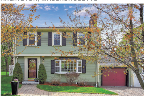
32 Prospect Avenue

$1,575,000 | sothebysrealty.com/id/VQCKH8 Gibson Sotheby's International Realty