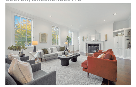
380 Beacon Street, Unit 1

$3,600,000 | sothebysrealty.com/id/LTPF4B Gibson Sotheby's International Realty