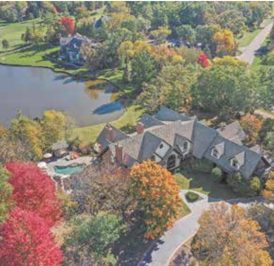
51 Hillburn Lane North Barrington, Illinois | $2,950,000 5 BD | 7.0 BA | sothebysrealty.com/id/YMG9S4