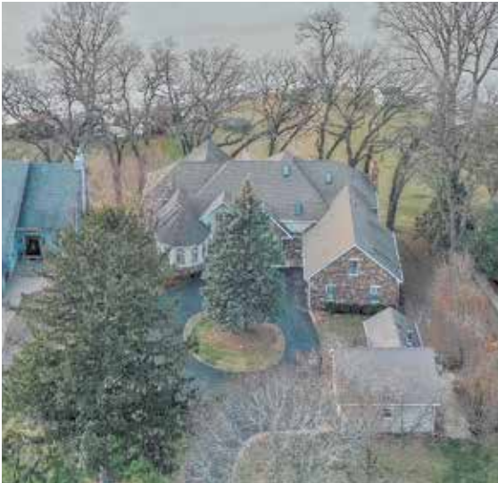
605 Lake Shore Boulevard Wauconda, Illinois | $1,775,000 5 BD | 6.0 BA | sothebysrealty.com/id/KPJHLV