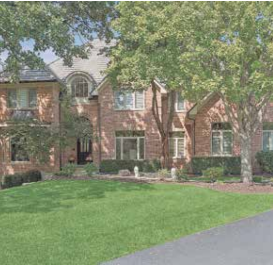
47 S Wynstone Drive North Barrington, Illinois | $1,550,000 4 BD | 6.0 BA | sothebysrealty.com/id/QWK86C

Jameson Sotheby's International Realty| 425 W. North Ave, Chicago, IL 60610 | sothebysrealty.com