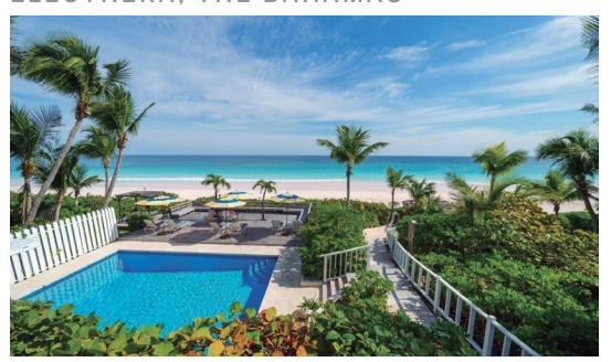
Harbour Island: Runaway Hill $28,000,000 | sirbahamas.com/id/51777 Bahamas Sotheby's International Realty