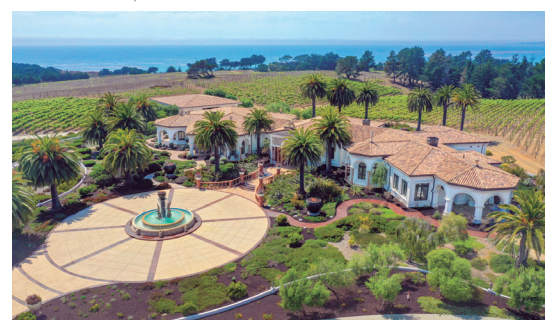
7292 Exotic Garden Drive $30,000,000 | sothebysrealty.com/id/Q2HKPT Russ Lyon Sotheby's International Realty