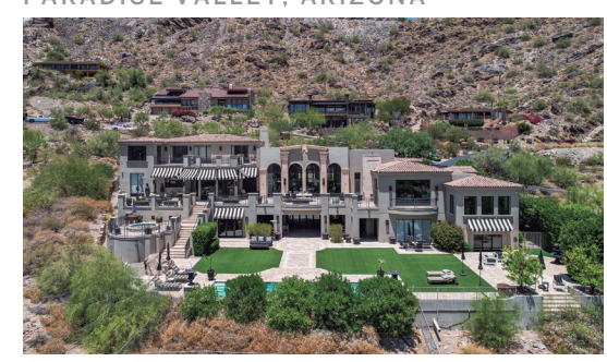
7046 N 59th Place $17,950,000 | sothebysrealty.com/id/C53EFV Russ Lyon Sotheby's International Realty