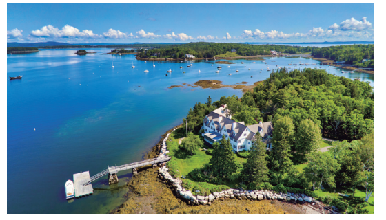
188 Aldrich Road $8,500,000 | sothebysrealty.com/id/WGVTEK Legacy Properties Sotheby's International Realty