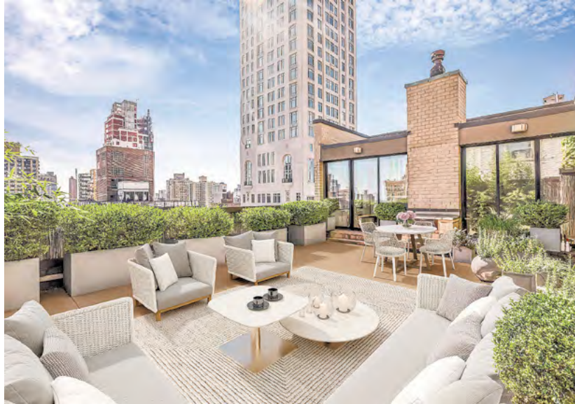
1474 Third Avenue, PHS 3 BR | 3.5 BA | $4,480,000 1474ThirdAvePHS.com