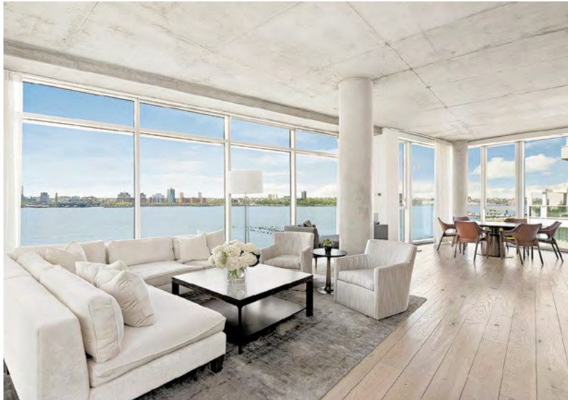
173 Perry Street, 8N 2 BR | 2 BA | $5,950,000 173PerrySt8N.com