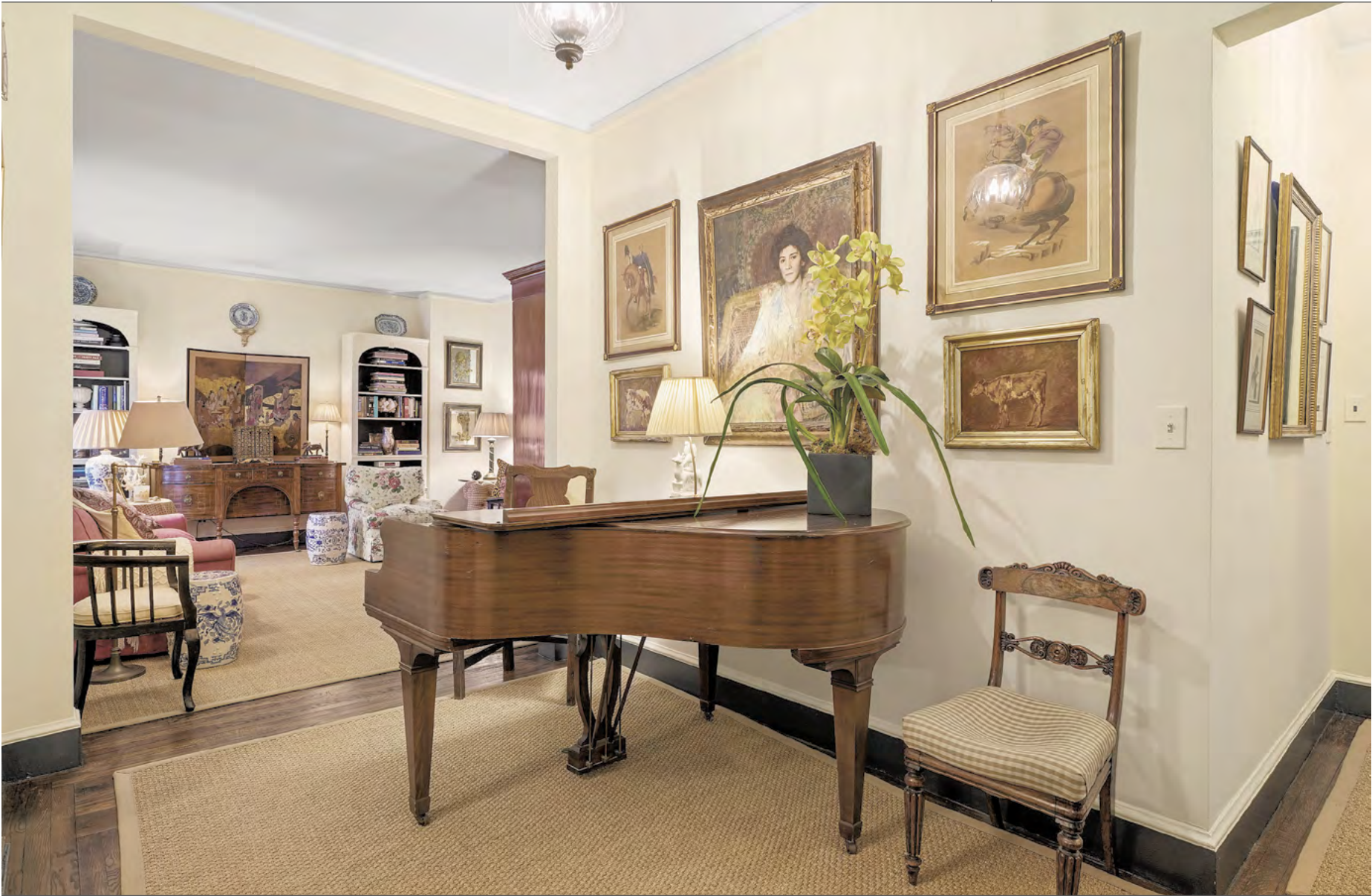
550 Park Avenue, 16AE 2 BR | 2 BA | 1,225 SQ. FT. $2,325,000

This 5-room residence is ideally situated on the 16th floor, with sunny open views, including an oblique view of Central Park from the master bedroom. With charmingly scaled rooms, nearly 10-foot ceilings, and well-designed division between public and private space, this two bedroom, two bathroom apartment is a perfect home or part-time residence and a rare opportunity to live in one of New York's most distinguished cooperatives.