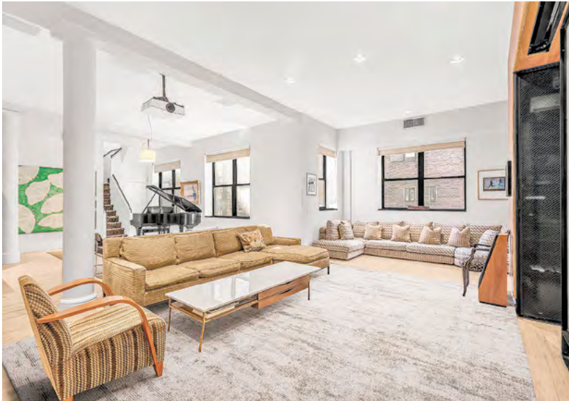
129 Fifth Avenue, 701 4 BR | 3 BA | $5,250,000 129FifthAve701.com