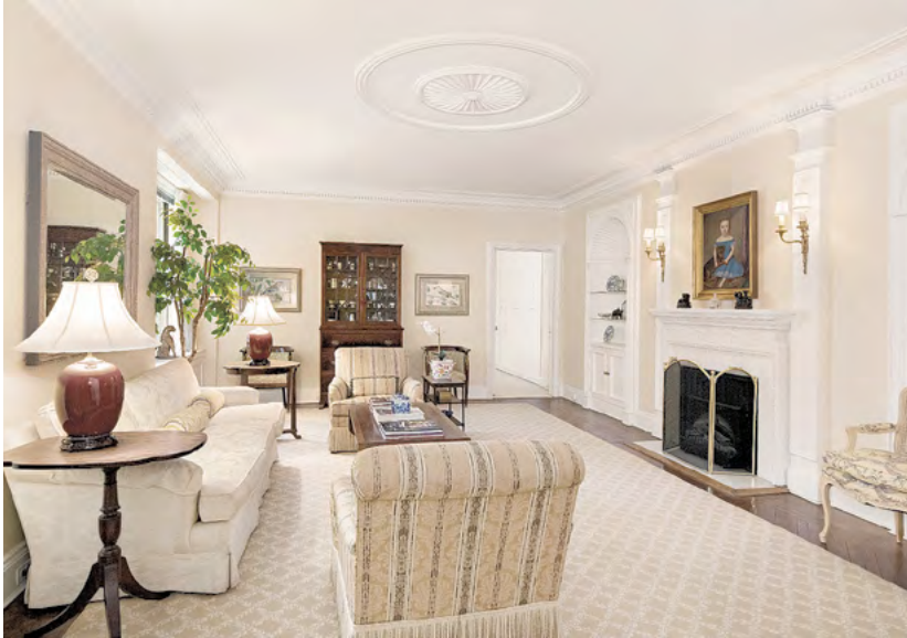
781 Fifth Avenue, 613-616 3 BR | 3 BA | $995,000 781FifthAve613-619.com