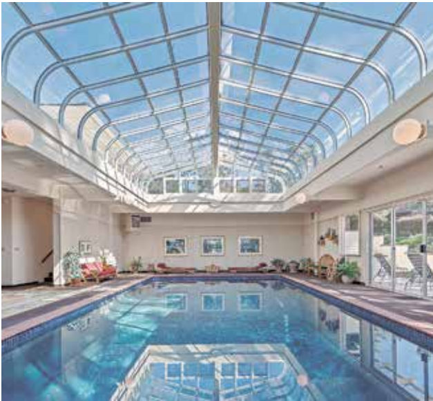
1272 Cantera Court Pebble Beach, California | $4,495,000 | 1272Cantera.com 4 Bedrooms | 5 Full Baths | 3,404± sq.ft. of living space on 1.314± acre lot | Indoor heated pool with wet bar | Beautifully landscaped grounds