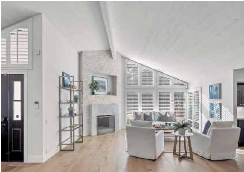
4077 Los Altos Drive Pebble Beach, California | $2,695,000 3 Bedrooms | 2 Full, 1 Half Baths | 4077LosAltosDrive.com