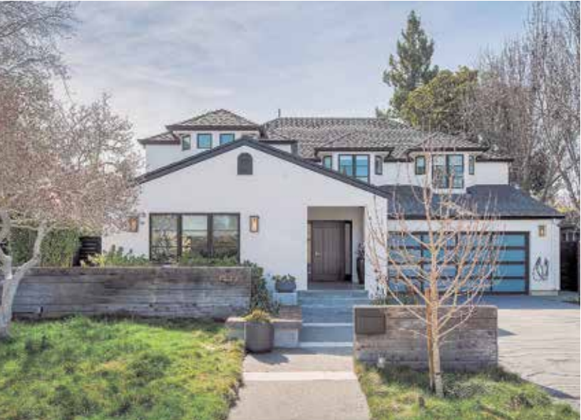
1430 Greenwood Avenue Palo Alto, CA | $8,500,000 7 BD | 5.5 BA | 1430greenwood.com

Golden Gate Sotheby's International Realty | 640 Oak Grove Avenue, Menlo Park, CA | dreyfus.group