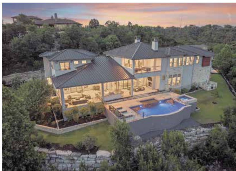
821 Laughing Dog Court Leander, Texas | $2,495,000 5 BD | 4.5 BA | 821laughingdog.com