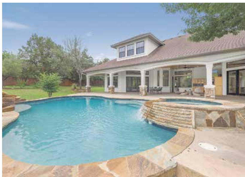
17237 Rocky Ridge Road - SOLD Austin, Texas | $1,649,000 5 BD | 4.0 BA