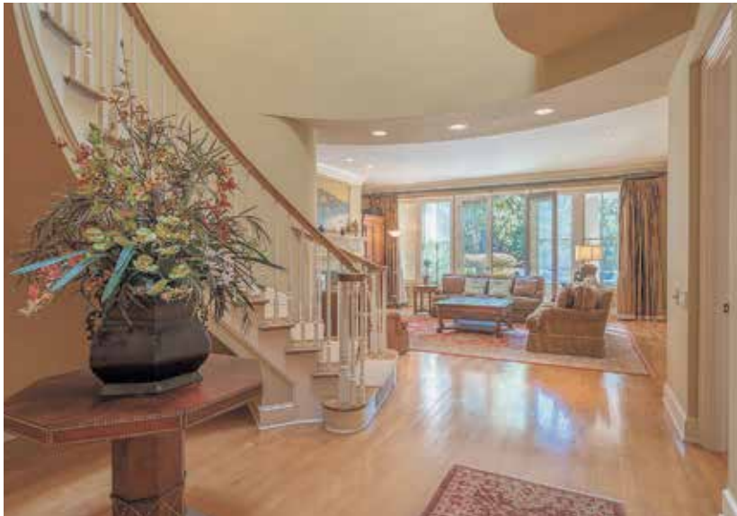
64 Spanish Bay Circle Pebble Beach, California | $4,495,000 4 Bedrooms | 4 Full, 1 Half Baths | 64SpanishBay.com