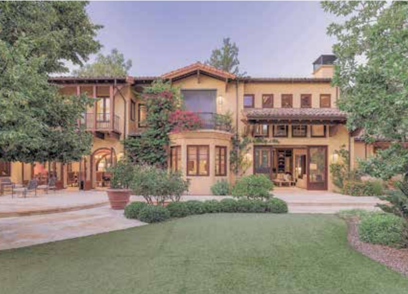
995 Matadero Avenue Palo Alto, CA | $15,500,000 4 BD | 6 BA | 995matadero.com