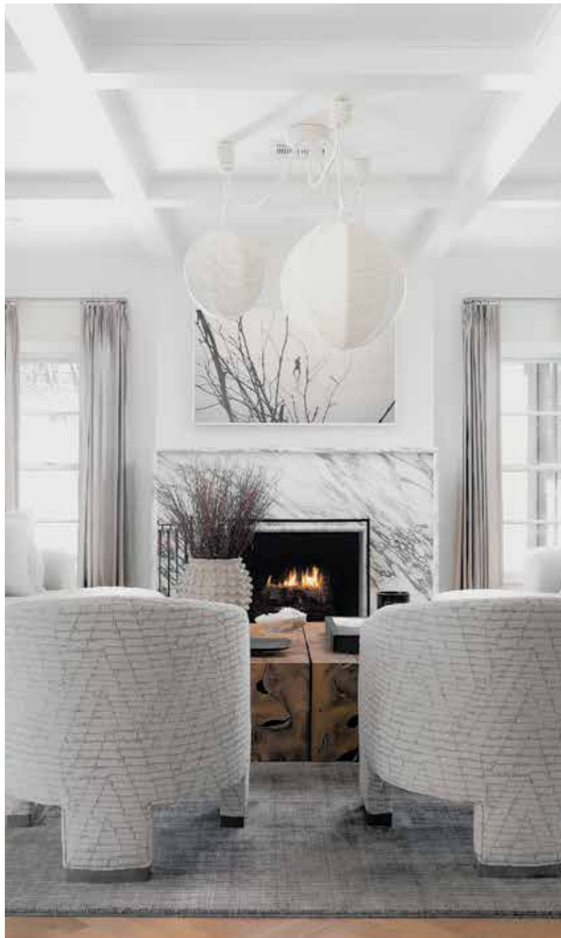
3625 Windsor Road 5 BR | 5.2BA | PRICE UPON REQUEST thewindsorroadestate.com