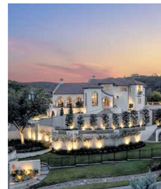
The Prominence of Austin 6 BR | 6.4 BA | PRICE UPON REQUEST TheProminenceofAustin.com