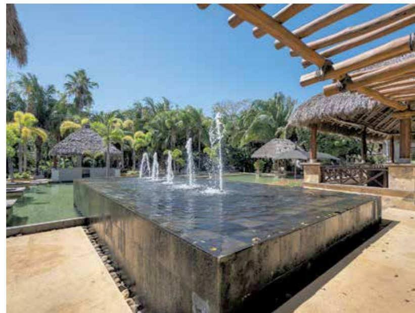
10 Avenida Taurrima A-401, Haixa, Litibú, Nayarit