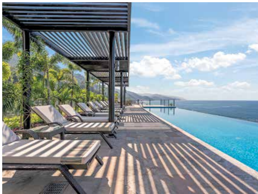
Blue Horizon 302, Callejón Lomas del Pacifico Mismaloya