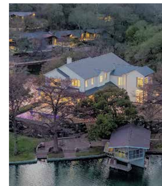
The Peninsula of Lake Austin 5 BR | 5.3 BA | PRICE UPON REQUEST ThePeninsulaofLakeAustin.com

KUPER SOTHEBY'S INTERNATIONAL REALTY | AUSTIN, TEXAS