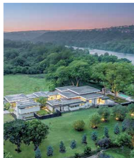
The Legacy of Lake Austin 9 BR | 8.3 BA | $42,000,000 LegacyofLakeAustin.com