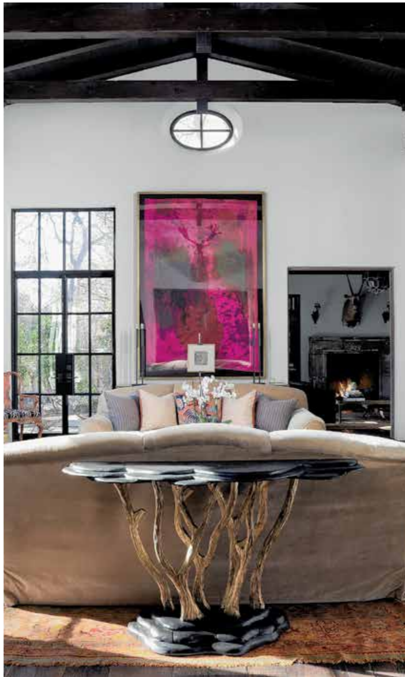
2509 Tarryhill Place 6 BR | 7.3 BA | PRICE UPON REQUEST 2509tarryhillplace.com